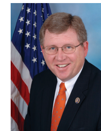
Rep. Frank Lucas

Rep. Frank Lucas (R-OK), ranking member of Science Committee, and Rep. Mike Kelly (R-PA), member of House Ways & Means Committee